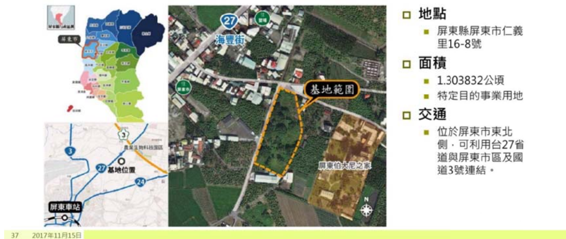
Figure 2: The Haifong Multi-level Care Facility for Dementia Project